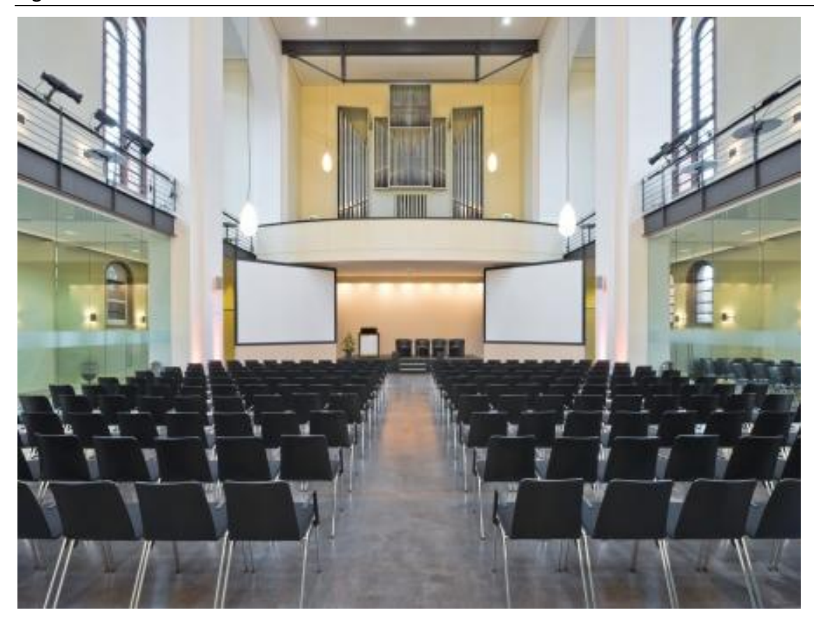
Figure 2: Umweltforum – main hall

The project team reserved the Umweltforum, Pufendorfstr. 11, 10249 Berlin for the meeting and the evening reception. The foyer as well as the main hall and several separate meeting rooms are available.